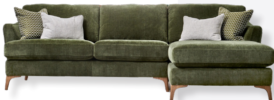
Hartley Chaise Sofa, Fabric Was £2699 Now £2135