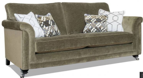
Fleming Grand Sofa, D Grade Fabric Was £1759 Now £1599