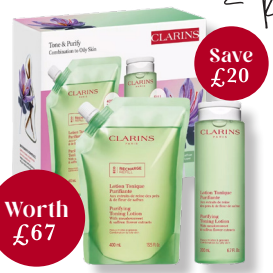
CLARINS Tonique Refill Set £47