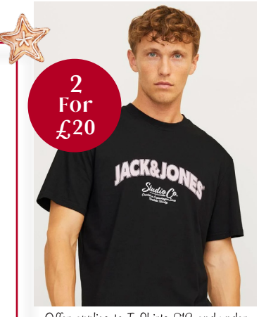
Offer applies to T-Shirts £12 and under