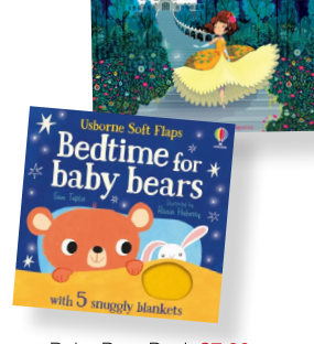
Baby Bear Book £7.99