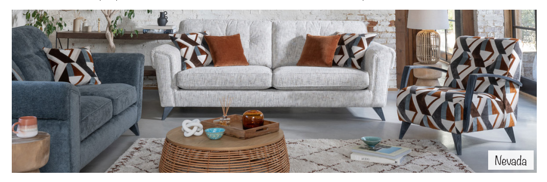
Nevada has a minimalist design which can integrate into any interior style from modern and Scandinavian to traditional and eclectic settings. Angular style arms are finished with tapered legs. Available in on trend slubby chenille or velvet fabrics. Make a statement and provide a cosy atmosphere with the Nevada.