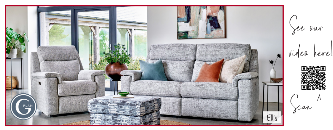
Ellis offers a clean, modern design with deep comfort proportions and a high back styling. Innovative Power Headrest and Lumbar actions available on Power Recliner models. Also available as Static or Manual versions.