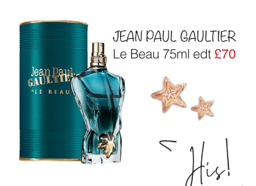
ESTÉE LAUDER Aramis for Men 110ml & 60ml Gift Set edt £72