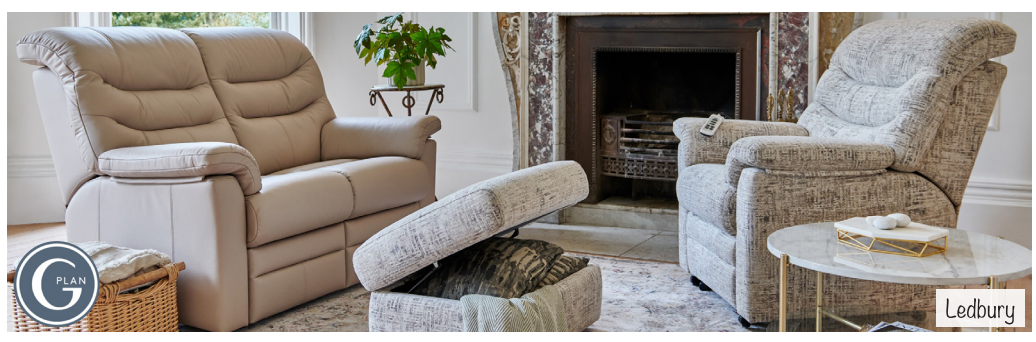
Ledbury is crafted with classic G Plan comfort and elegance and is the answer to all your relaxation needs. Options include supportive Power Headrest and Lumbar features as well as Static models. The high back and generous cushioning provide supreme comfort.