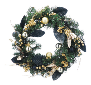
FFQTIVE Gold Wreath £44