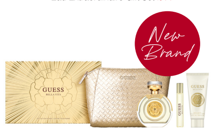
GUESS Bella Vita Gift Set 100ml edp £59