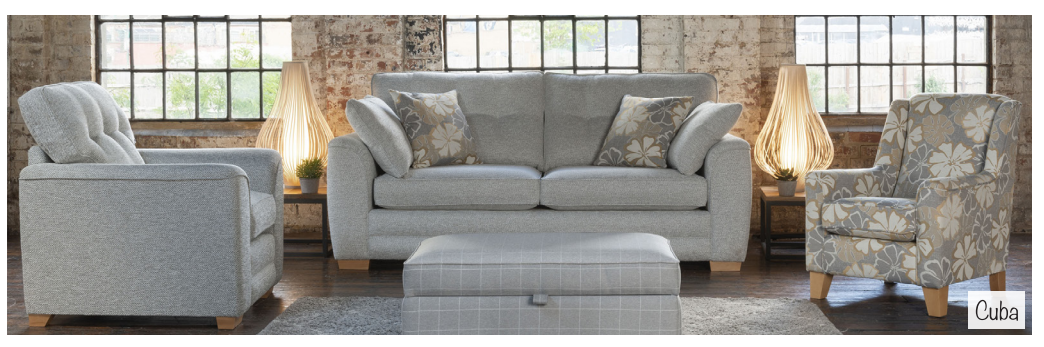
Cuba offers a blend of contemporary design and subtle curves of retro chic. Beautifully proportioned and tailored with a button back which is perfect to sink in to.