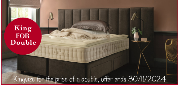
Special Offer RRP £2670 Kingsize FROM £1749