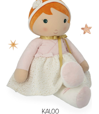
My First Valentine Doll H80cm £82.50