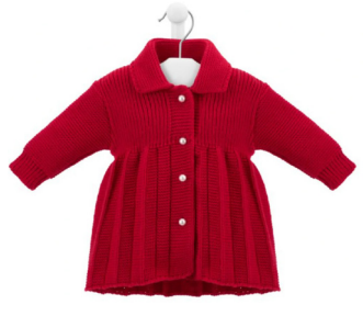
Red Cardigan Dress/Coat £24.50 Cinderella Book £5.99