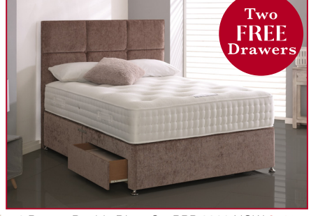
2 Drawer Double Divan Set RRP £903 NOW £769