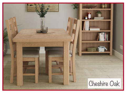
Extending Dining Table (120cm - 153cm)