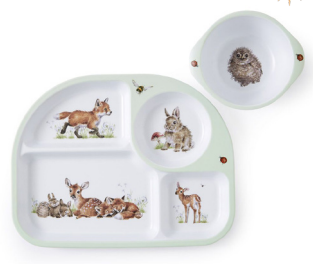
WRENDALE Two Piece Dinner Set £15