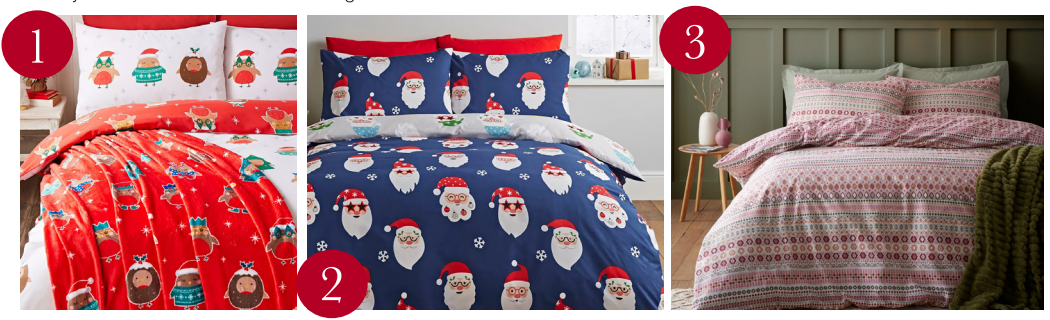
2. Santa Spec-Tacular Duvet Set Double £19 King £25

1. Party Robin Duvet Set Double £22 King £27