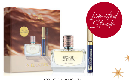
ESTÉE LAUDER Bronze Goddess Eau Fraiche 100ml Gift Set £58