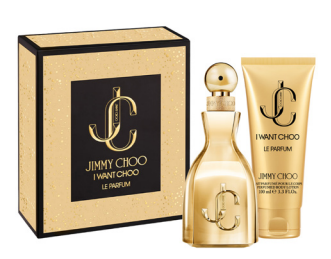
JIMMY CHOO I Want Choo Le Parfum 60ml Gift Set £81